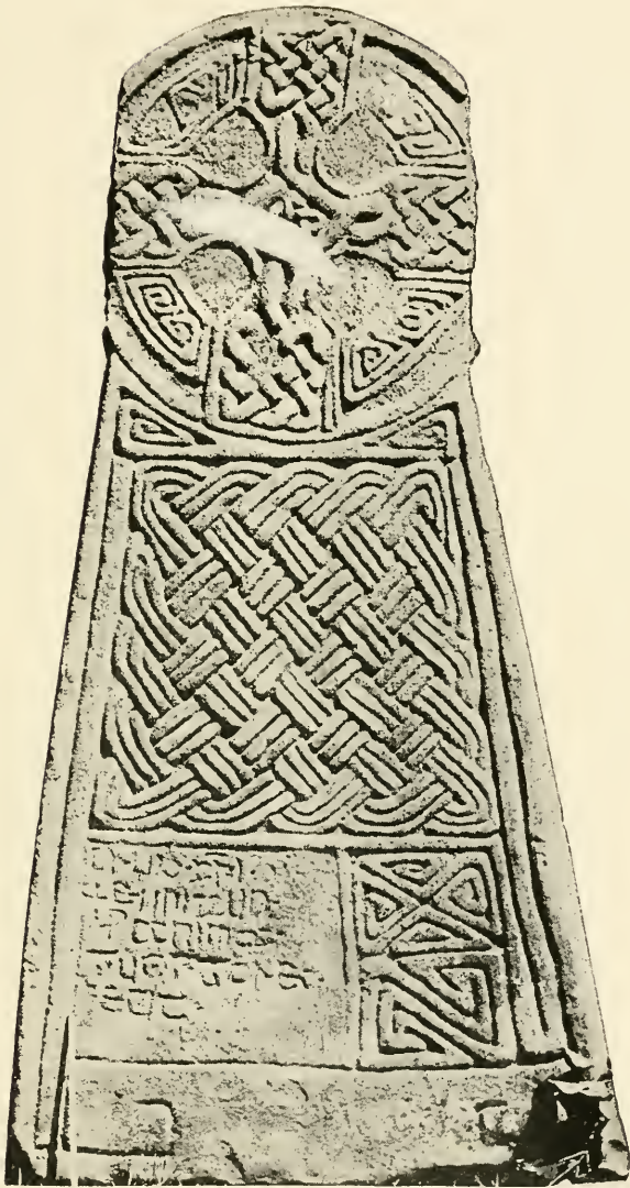
CROSS OF ENNIAUN AT MARGAM.